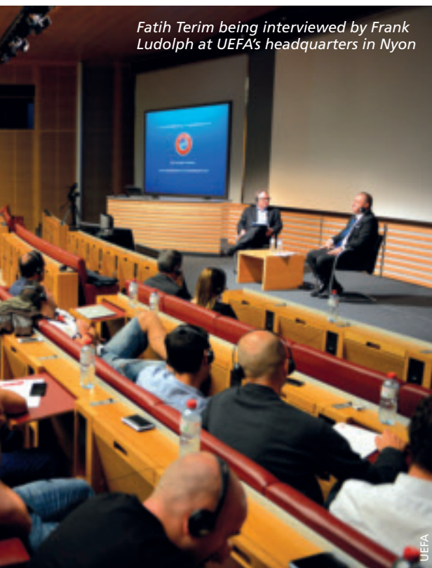
Fatih Terim being interviewed by Frank Ludolph at UEFA's headquarters in Nyon