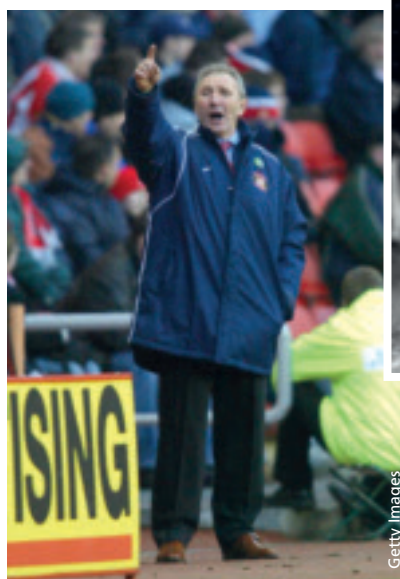
On the touchline with the late Sir Bobby Robson

I am very anxious to make them aware of the downsides. The first question has to be: 'What is it you really want to do?' Not everyone can be top man. Some people just don't have the qualities. But there's no disgrace in that. So