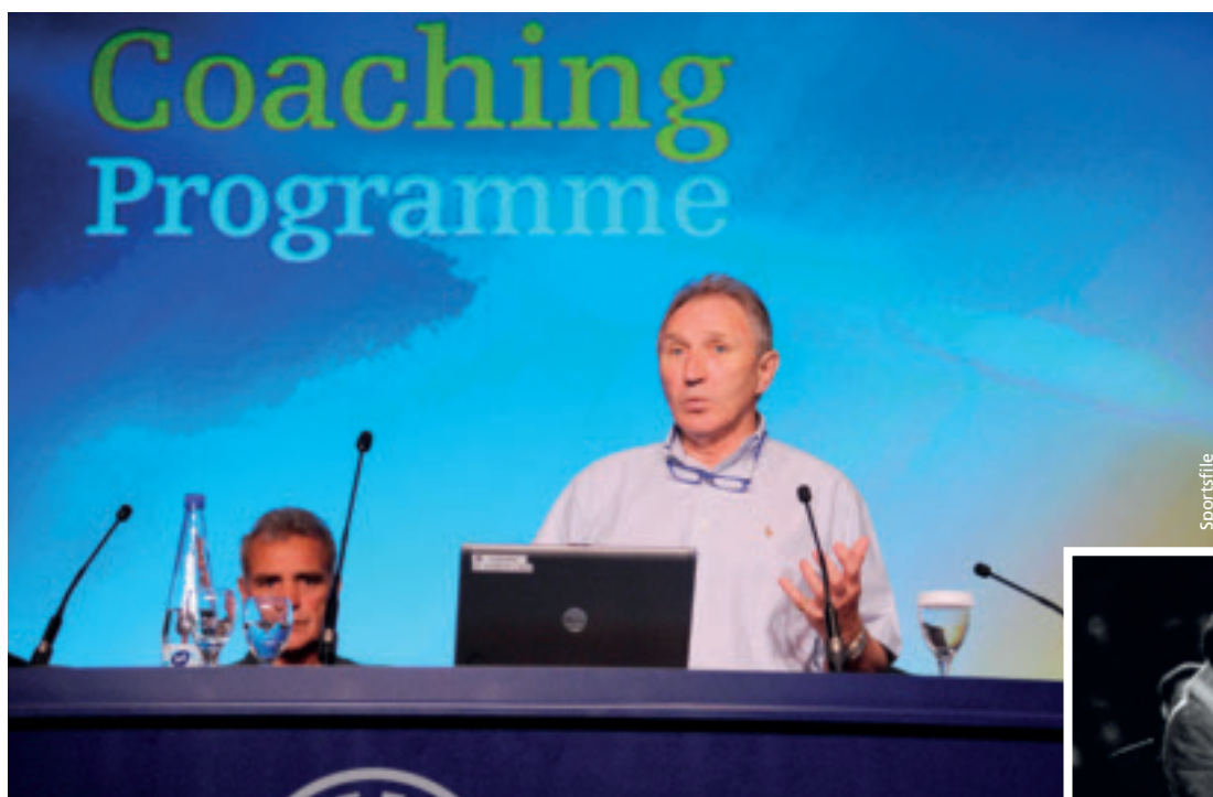
Howard Wilkinson on stage at one of his many UEFA coaching events

Because I have visited countries on working missions, I've been able to see the real Greece, the real Turkey, the real Hungary. I remember going to Ukraine one winter. One of my early coaching heroes was Valeriy Lobanovskyi. So I'm there at the Dynamo [Kyiv] training ground and seeing the room where Lobanovskyi developed his statistical models and profiles. And I'm in their own operating theatre ... Many clubs have got one now but in Ukraine they'd had one for years. I've been very fortunate in meeting different people, experiencing and absorbing different cultures, hearing different points of view ... It has been an ongoing learning programme. For me that is not 'work'. Some would say I haven't done a real day's work in my life! Though that's not quite true because there were times when I was a footballer when you needed to find another job in the summer. I have worked on a building site, in a timber yard, as a chauffeur, as a postman ... So I have worked in the conventional sense, but my real work has always been football and sport in general. I think the best thing about it all is that you meet people who have a genuine common passion – they're involved in the game of football and love it. That's the common ground. It has been a privilege to be involved in it.